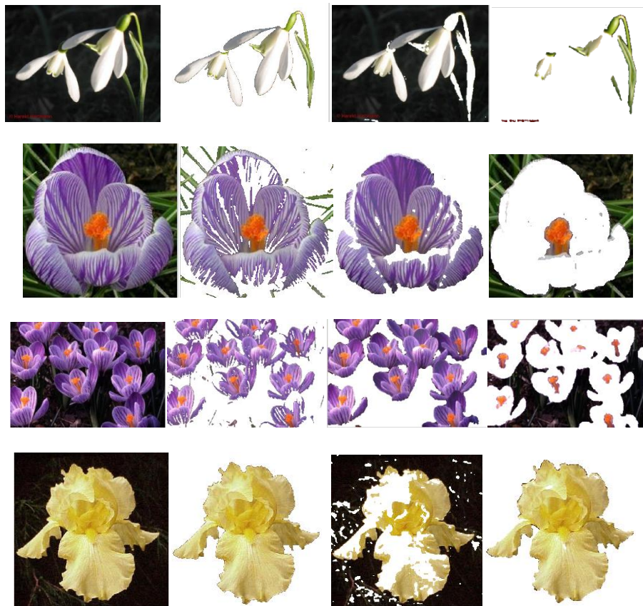
a) original image b) L component c) a component d) b component

So b component is having good result rather than L and b in this case.