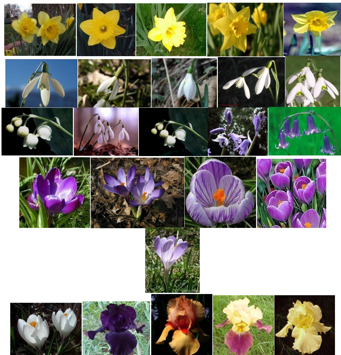
Fig.2. Oxford flower collection