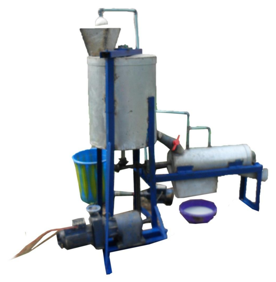
Plate 1: Pictorial view of cassava starch extraction machine

This unit supplied power that rotates both the stirrers and the screw conveyor with 2Kw electric motor through chain and sprocket