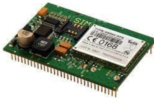
Fig 1. GSM Modem

Global system for mobile communication (GSM) is a globally accepted standard for digital cellular communication. GSM is the name of a standardization group established in 1982 to create a common European mobile telephone standard that would formulate specifications for a pan-European mobile cellular radio system operating at 900 MHz. A GSM modem is a wireless modem that works with a GSM wireless network. A wireless modem behaves like a dial-up modem. The main difference between them is that a dial-up modem sends and receives data through a fixed telephone line while a wireless modem sends and receives data through radio waves. The working of GSM modem is based on commands, the commands always start with AT (which means ATtention) and finish with a <CR> character. For example, the dialing command is ATD<number>; ATD3314629080; here the dialing command ends with semicolon. The AT commands are given to the GSM modem with the help of PC or controller. The GSM modem is serially interfaced with the controller with the help of MAX 232.