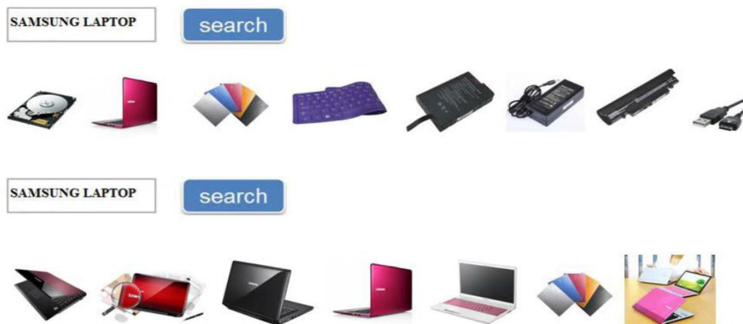
Fig. 1: (top) non-personalized and (bottom) personalized search results for the query "Samsung Laptop".

Searching for apple by a farmer has a different meaning from searching by a technical person .There is one solution to solve these problems is personalized search where user specific information is considered to distinguish between exact intentions of user queries and re-ranked the images.