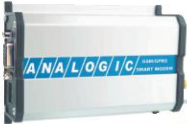
“Figure 3. GSM smart modem”