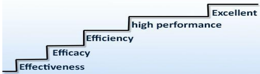
Shape No. (2): Maturity ladder performance

Certainly every performance be distinguished by the optimum use for the abovementioned resources, it is inevitable to indicate the performance maturity stairs as it explained in the shape below: