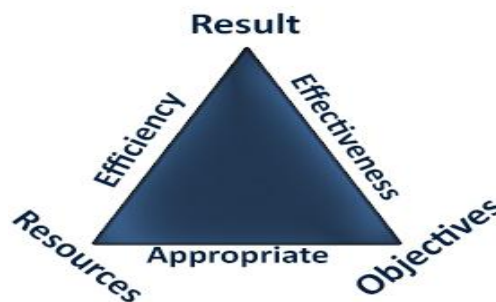
Shape No. (1): Performance triangle and measurement indications

Performance is an achievement of results by predefined goals but we have to differentiate between a performance and another performance, every performance should have three things that known as performance triangle and measurement indications as it explained in the shape bellow: