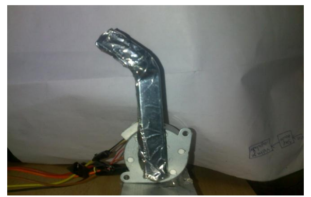
Fig.1.Prosthetic index finger

In this paper, we propose and develop a new prosthetic index finger based on the EMG signals. The proposed system uses EMG signals to realize a control of the prosthetic index finger.