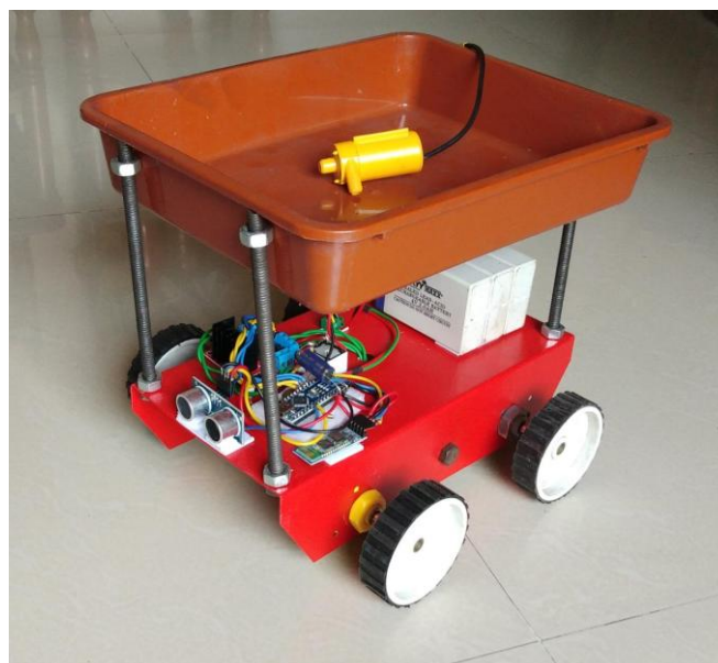
Fig 3. Self Balancing Robot for Medical Emergency