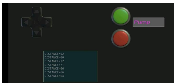
Fig 4. Operating System on Mobile

When the robot moves TO and DOWN freely it shows nonstop variation of distance in the terminal.