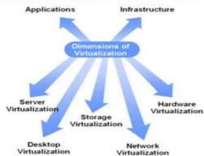
(Fig 3: Virtualization : The key to Green Computing)