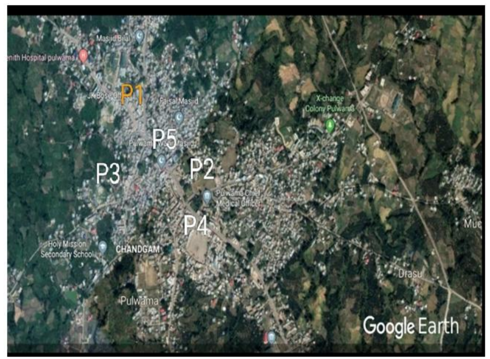
Figure 1 : Satellite image of Pulwama town showing different locations

Pulwamadistrict falls India's northern state of Jammu and Kashmir at 33.88°N74.92°E. It is also known as "Anand of Kashmir" (the joy, the delight)and "DudhaKul of Kashmir" (milk city) with total area of 1,398km<sup>2</sup>and populationdensity of 550/km<sup>2</sup>.TheThe area is one of the most important economical hubs of the Kashmir valley. The strip of the road in consideration extends alongPulwama market via(Animal husbandry toRajporaChowk) (P1), (Post office to Rajporachowk)(P2),(Chat masjid to RajporaChowk)(P3), (RajporaChowk to Muranchowk)(P4)& (Muranchowk to District Hospital)(P5). The said strip is the busiest of the town in terms of business, shopping, governmental & nongovernmental departments, educational institutes & district hospital. The traffic volume is always very high during the peak hours and the width of the road is not sufficient to carry the whole traffic hence results in a large congestion over the whole stretch. Figure 1 shows the satellite image of selected Locations used in our study.