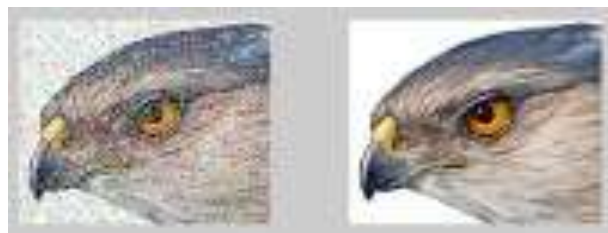
Original Input Image Enhanced Image Fig 2 Enhanced Output Image after Salt-and-pepper Noise removal