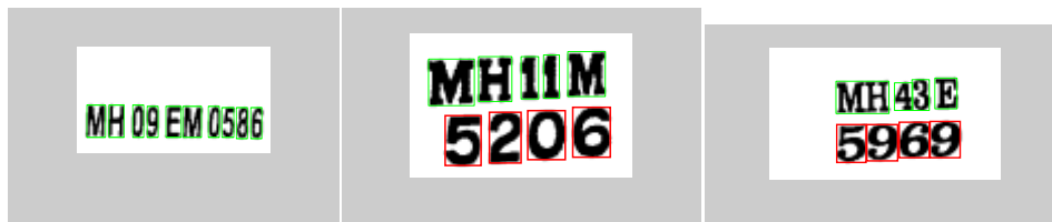
Fig. 3 Extracted script from yellow plate for one line and two line.

The plate containing yellow background contains single line or two line representation of license plate. The image of license plate will be converted to gray and binary for further pre processing. With the help of character height and first pixel of character bounding box of characters are represented as one line character. If two lines are present on the license plate, similar procedure will be implemented for another line. These two lines are separated and represented with green and red color bounding boxes respectively, as shown in fig 3.