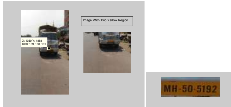
Fig. 2 Vehicle containing two yellow regions.

The plate containing yellow background contains single line or two line representation of license plate. The image of license plate will be converted to gray and binary for further pre processing. With the help of character height and first pixel of character bounding box of characters are represented as one line character. If two lines are present on the license plate, similar procedure will be implemented for another line. These two lines are separated and represented with green and red color bounding boxes respectively, as shown in fig 3.