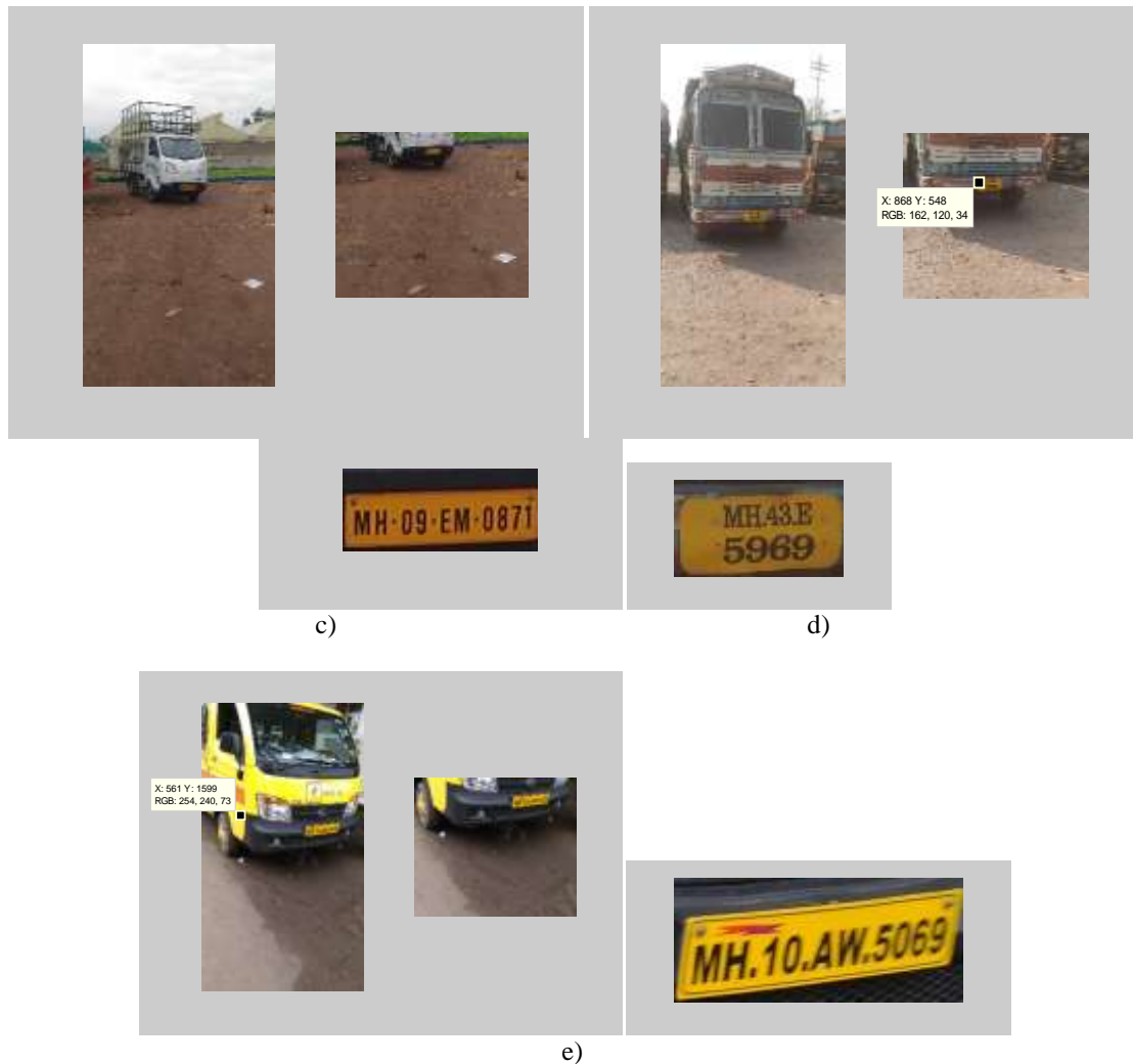
Fig.1 Images for different vehicles.