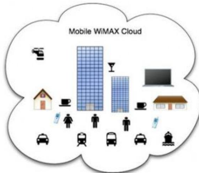
Figure 2: Mobile WiMAX

Mobile WiMAX is used to refer to systems built using 802.16e-2005 and the OFDMA PHY as the air interface technology. Both fixed and mobile services are delivered by using mobile WiMAX implementations. Mobile WiMAX takes the fixed wireless application a step further and enables cell phone like applications on a much larger scale. Mobile WiMAX enables streaming video to be broadcast from a speeding police or other emergency vehicle at over 70 MPH. It offers superior building penetration and improved security measures over fixed WiMAX. It makes users to roam between service areas.