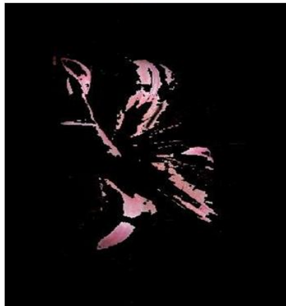
Figure 5: Objects in Cluster 4

Figure 5 shows most concentrated part of this image in the form of a cluster.