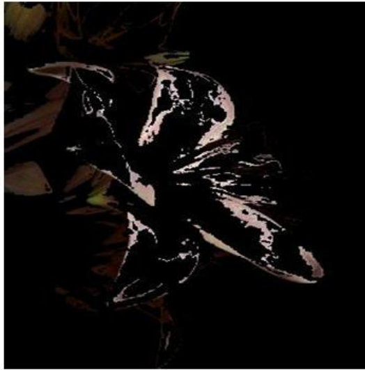
Figure 4: Objects in Cluster 3