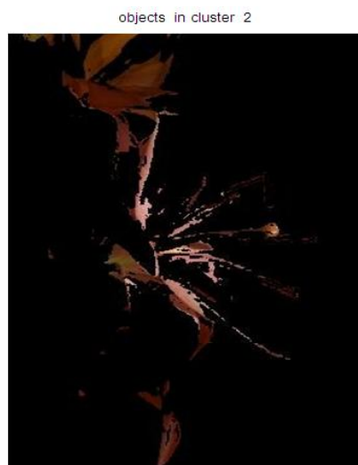
Figure 3: Objects in Cluster 2