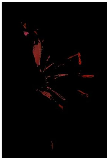
Figure 6: Objects in Cluster 5