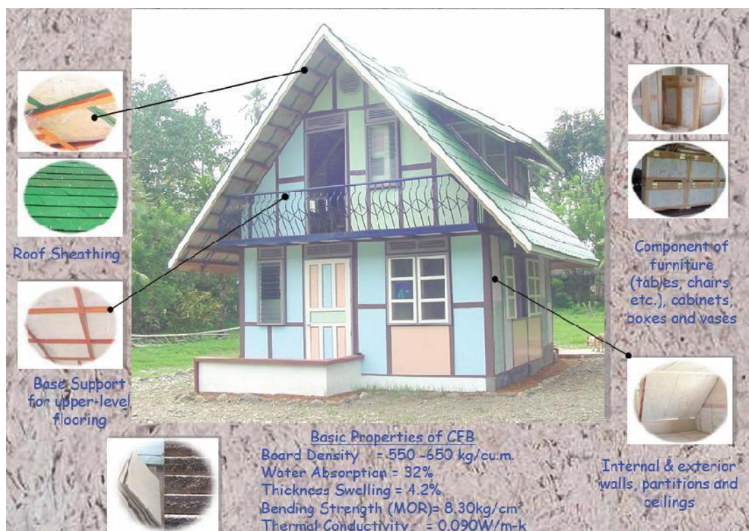
Figure 4. Applications of coconut fibre boards in house construction and other utilities (Luisito et al., 2005).