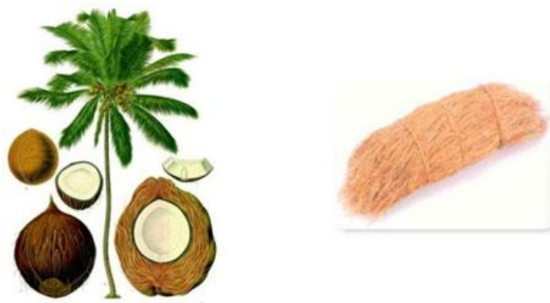
Figure 1. Coconut tree, coconut and coconut fibres.