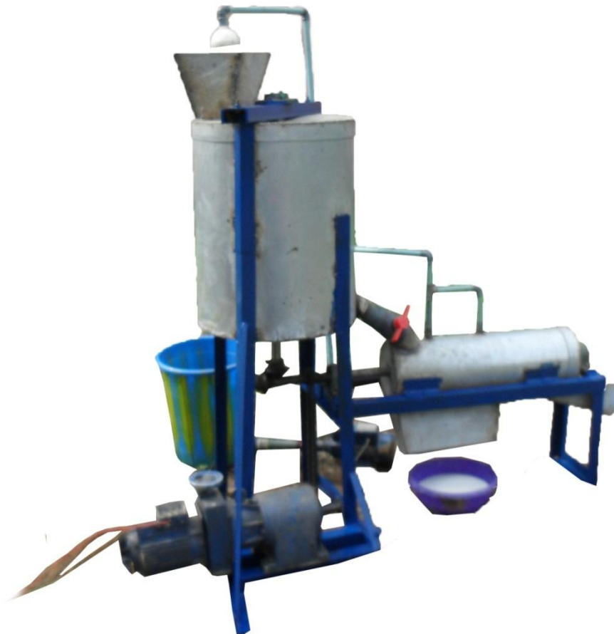
Plate 1: Pictorial view of cassava starch extraction machine

This unit supplied power that rotates both the stirrers and the screw conveyor with 2Kw electric motor through chain and sprocket