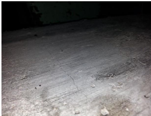
Fig.6 Propagation of crack to soffit of slab