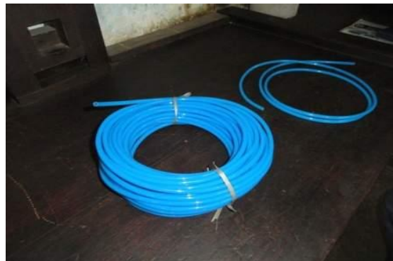
Fig.1 Polyurethane pipe as void former 6mm outer diameter

pH value is such that it will not cause any corrosion to the reinforcement. Viscosity of both the chemical shall be such that it will seal the minor cracks like shrinkage or temperature cracks. Working temperature of both the solution shall be wide. Void former of polyurethane selected so that it can be easily removed from concrete specimen as there is no friction between surfaces. This void former material is elastic and easily available in various diameters.