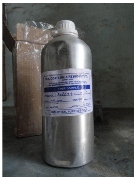
Fig.2 Epoxy resin(Dropoxy 7250)