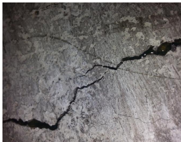
Fig.7 Chemical is released and appeared on surface