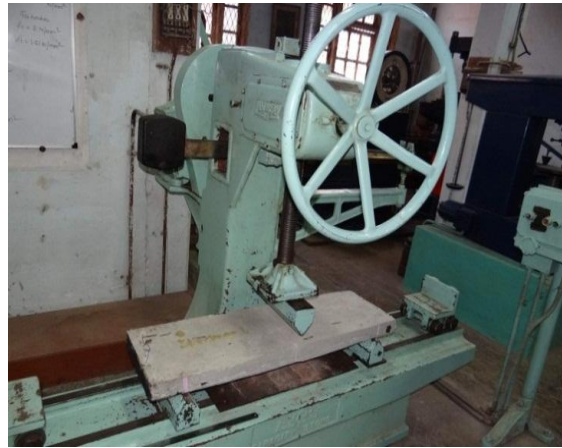
Fig.5 Slab specimen placed on one point flexure testing machine