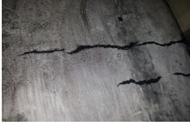
Fig.8 Crack sealed with resins and hardener