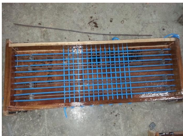
Fig.4 Shuttering for test specimen fitted with void formers

The methodology is mainly designed for flexural member and for crack formation within that member due to different loadings. To carry out one point flexural test a concrete specimen of 300mm x 70mm x 1000mm with 6mm dia. mild steel bars is such selected so that it will be a flexural member with sufficient width so that matrix of hollow ducts can be laid along it on the tension side of section. In the initial stage of testing we have provided ducts in two layers along the length and width in cover area of reinforcement of member with the help of polyurethane material of 6mm diameter. This Ducts then alternately filled with epoxy solution and hardener. Idea behind is when crack formation under loading will take place this two solutions will get mixed with each other forming hard compound together which will seal the crack.