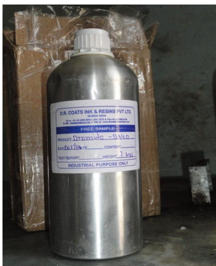
Fig.3 Hardener(Dromide 9340)