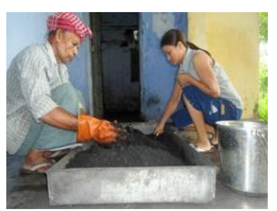
Plate : 8 Mixing of culture in carrier material

Plates showing Nitrofert biofertilizer production & experiment in the field