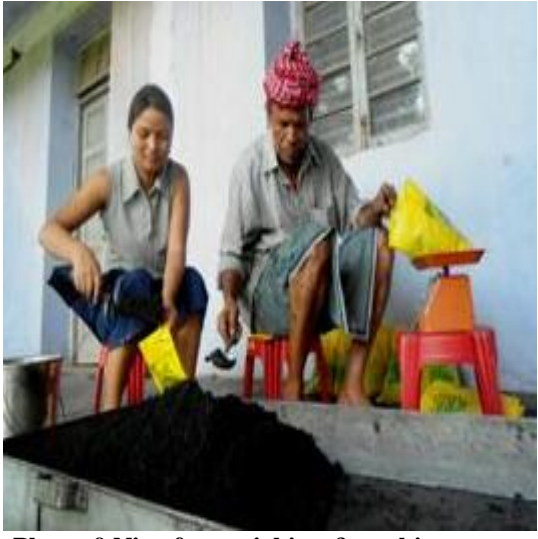
Plate : 9 Nitrofert weighing & packing

Plates showing Nitrofert biofertilizer production & experiment in the field