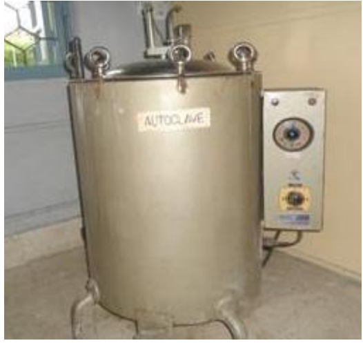
Plate: 3 Sterilization of culture media