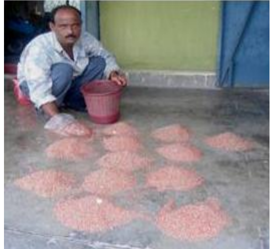
Plate : 12 Mixing of NPK fertilizer