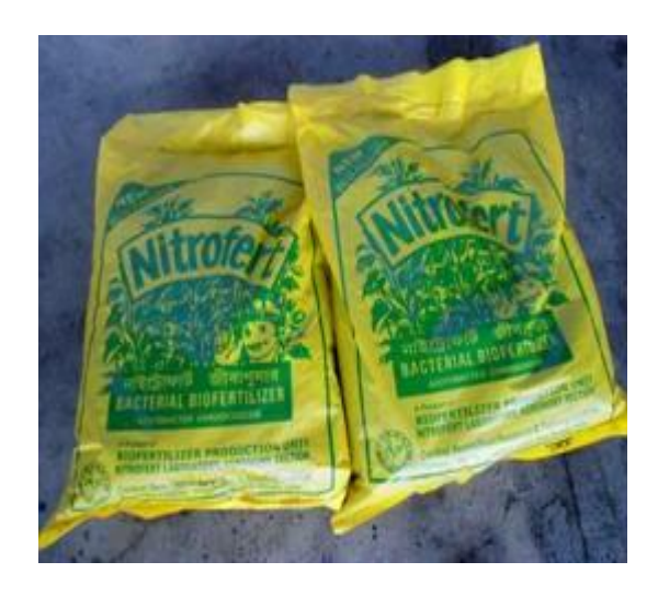
Plate : 10 Nitrofert Bio-fertilizer