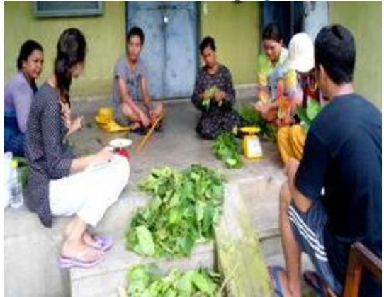
Plate : 16 Data collection