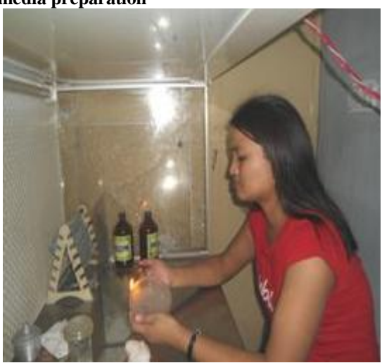
Plate : 4 Inoculation of A. chroococcum