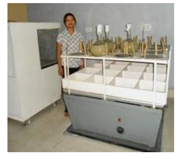
Plate : 6 Shaking for growth of culture