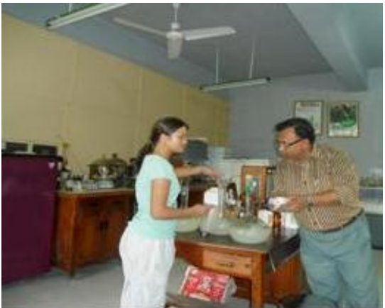
Plates : 1 & 2 Culture media preparation