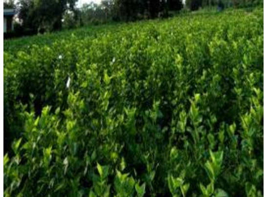
Plate : 15 Experimental plot