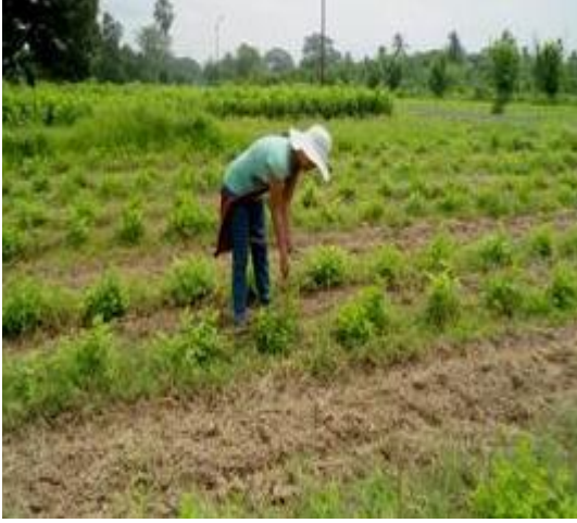
Plate : 11 Experiment Plot layout