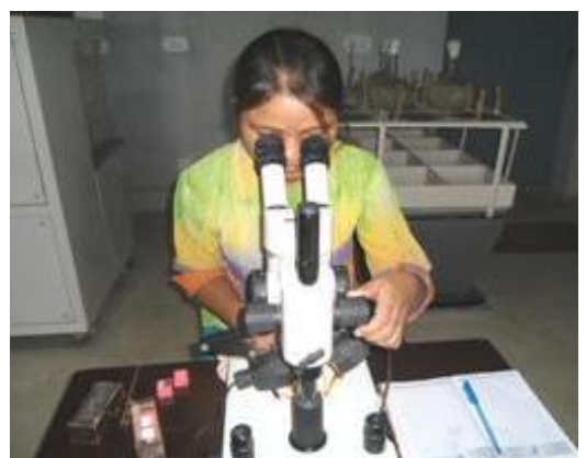
Plate : 7 Microscopic observation