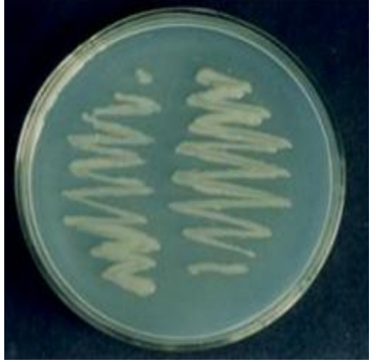
Plate : 5 A. chroococcum culture