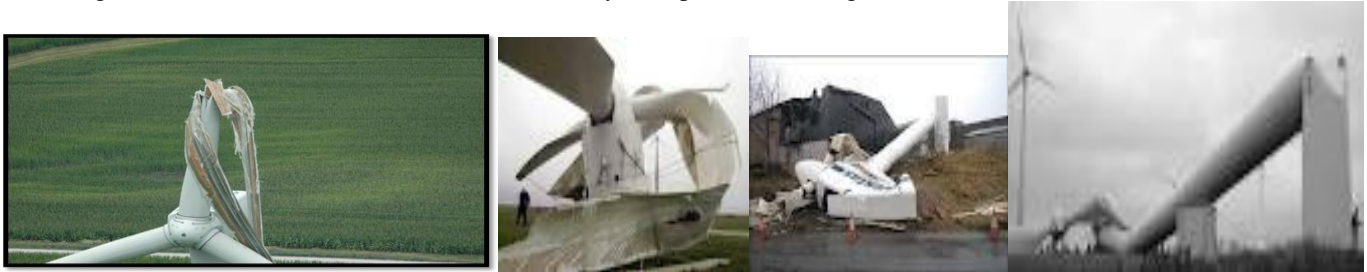
Fig 1.1 Different types of failure of wind turbine due to failure of blade

In this work fatigue failure of small wooden wind turbine blade by bending strength is found out with the help of crank eccentric bending fatigue failure test rig. A wind turbine blade of 1500 mm length and angle of attack 12 degree for maximum wind speed 25 m/s and rated output for 5 Kw. The long-term goal is to develop general approaches and generic models for each possible failure modes, so that the material properties can be fully utilized and the structural design can be optimized. The new design methods will enable the wind turbine industry to improve their design details and their choice of materials.