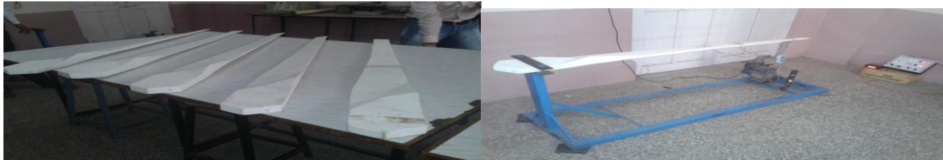
Fig. 2.1 Test rig used for rotating bending fatigue. And test specimen of wood wind turbine blade.

Crank eccentric type fatigue test rig with strain gauges and Load cell is use to measure the applied load.