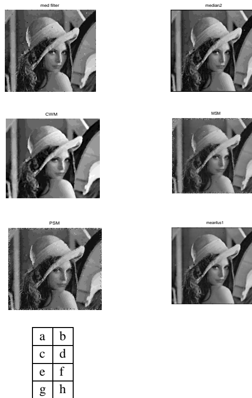
Fig 1 . (a) Original image (b) Noisy image with noise density of 20% (c) Output of Median I (d) Output of Median II (e) Output of CWM (f) Output of MSM (g) Output of PSM (h) Fused Output