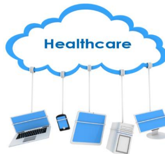
Fig. 1. Health record storage systems

With a rapid development of medical informationization,more