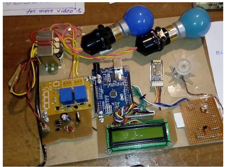
Fig. 4. Prototype of the project

ISSN (e): 2250 – 3005 // Volume, 14 // Issue, 2// Mar. - Apr. – 2024 // International Journal of Computational Engineering Research (IJCER)